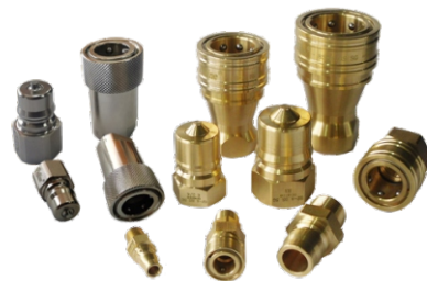
标准式样 standard style