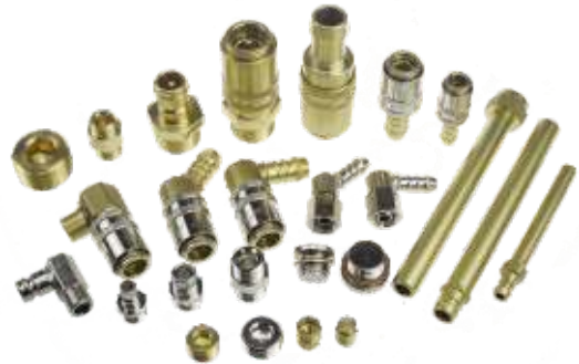
标准式样 standard style