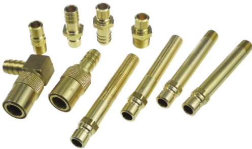
标准式样 standard style