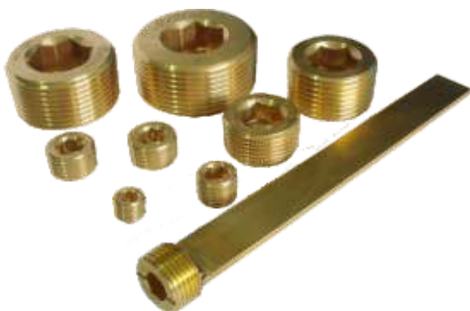
连接配件 connecting accessory