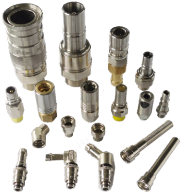
标准式样 standard style